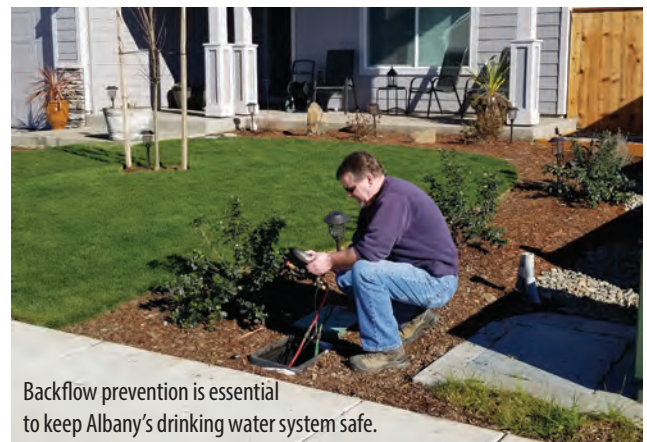
Backflow prevention is essential to keep Albany's drinking water system safe.

6 Ten homes in the Millersburg distribution system were tested for lead and copper at the customer's tap in August 2020. None of the homes exceeded the action level for lead or copper. All home owners were notified of their test results. Lead and copper standards are met if at least 90 percent of the samples have lead levels less than or equal to 15 ppb and copper levels less than or equal to 1.3 ppm. The 90th percentile was 1.1 ppb for lead and 0.025 ppm for copper in the Millersburg distribution system. The 90th percentile is reported to the Oregon Health Authority. The next sample set will be collected in summer 2023.